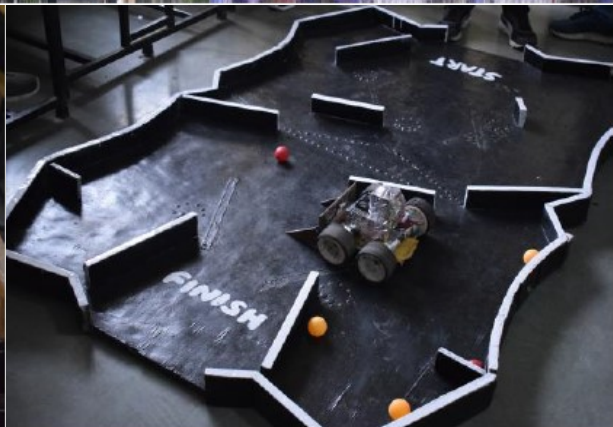
AVENSIS MSIT ANNUAL Fest 2020