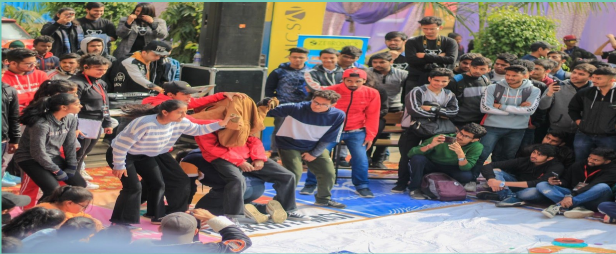
ENVA Cultural Fest MSIT 2020