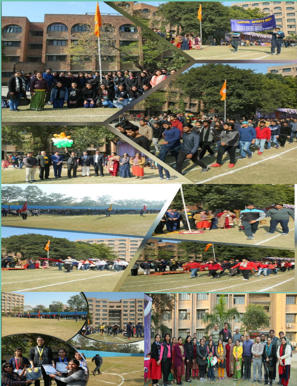
Annual Sports Day 2020