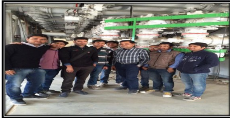
220 KV GIS Building

second way to operate the complete system if we are unable to access the fault from the main control room. Here we got a lot of information related to relays control and the connection of 220 KV bus bar system to isolators and other equipments and its protection. The gas used for insulation is SF 6 or sulfur hexa- fluoride which is filled in large enclosures at 6.45 atm pressure.