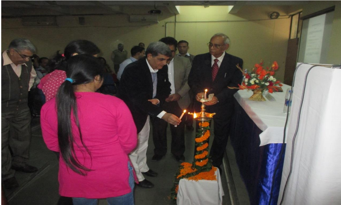
Lamp Lightening Ceremony