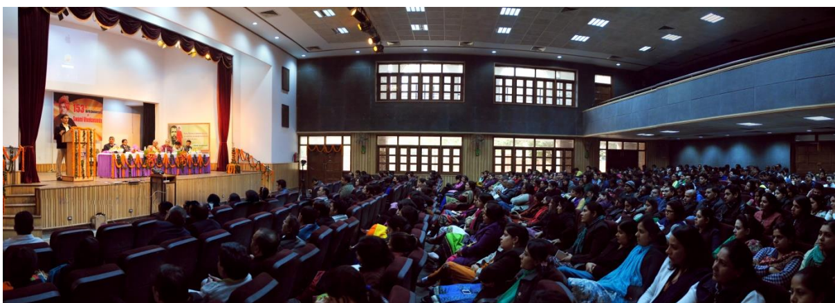
Guests and Dignitaries