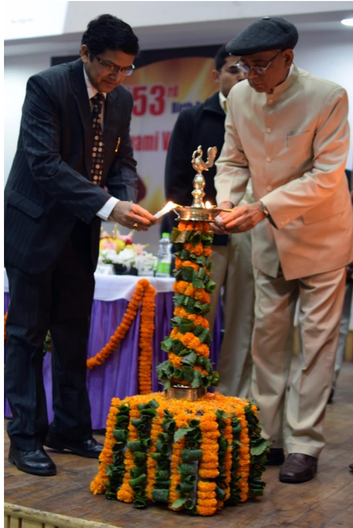
Lamp Lightning Ceremony