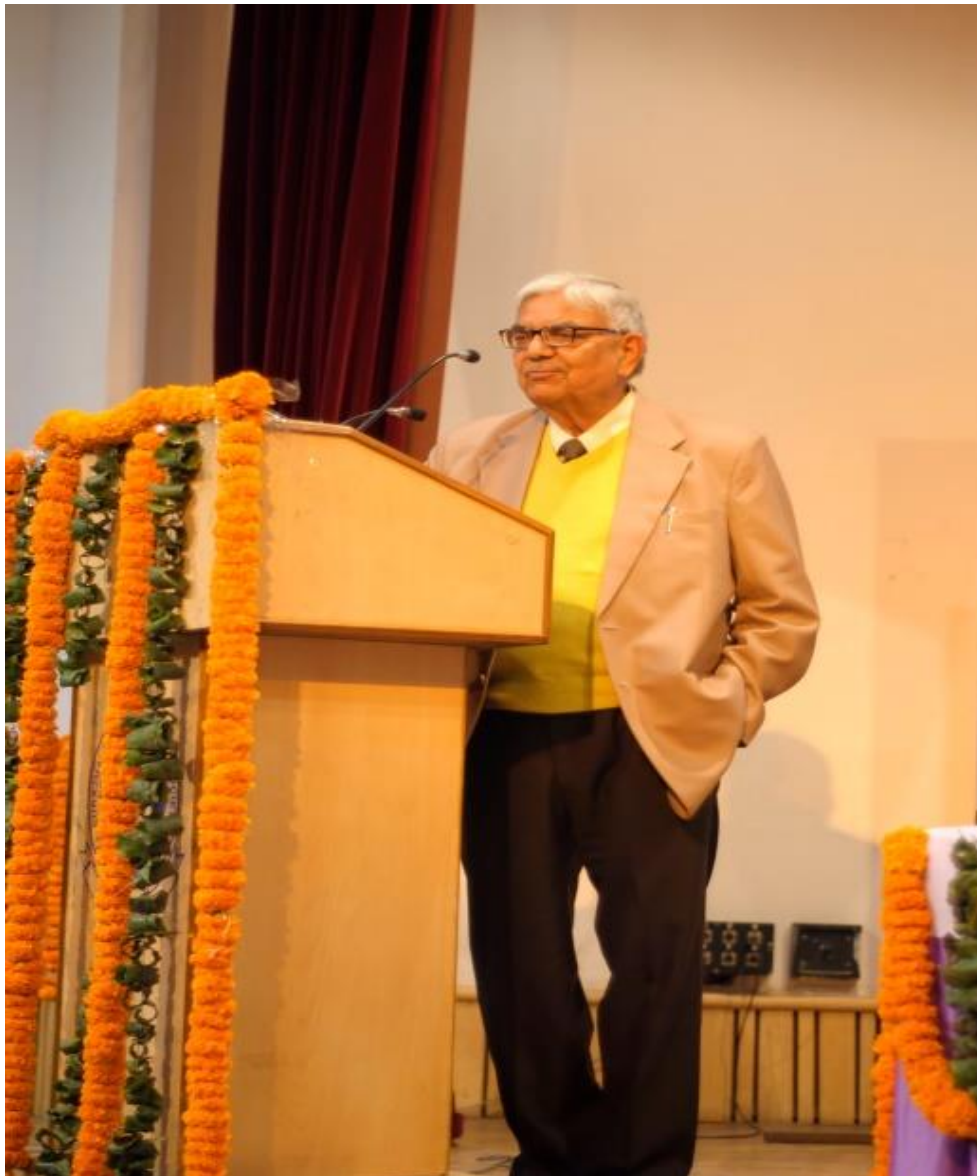
Address by Hon'ble Vice President